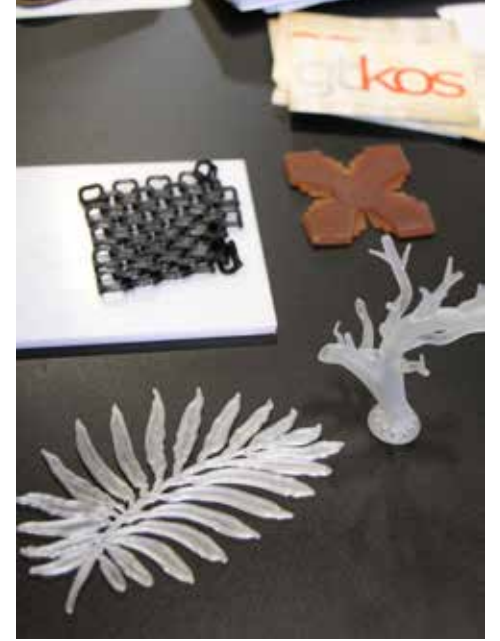
Examples of 3D prints at the GTKos exhibition stand Stage / Set / Scene Berlin 2019